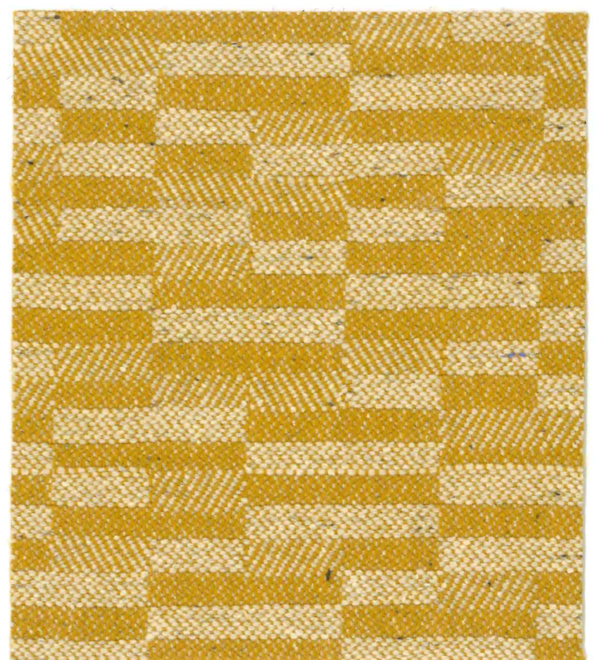
Buchanan Item Code CF1116/0301