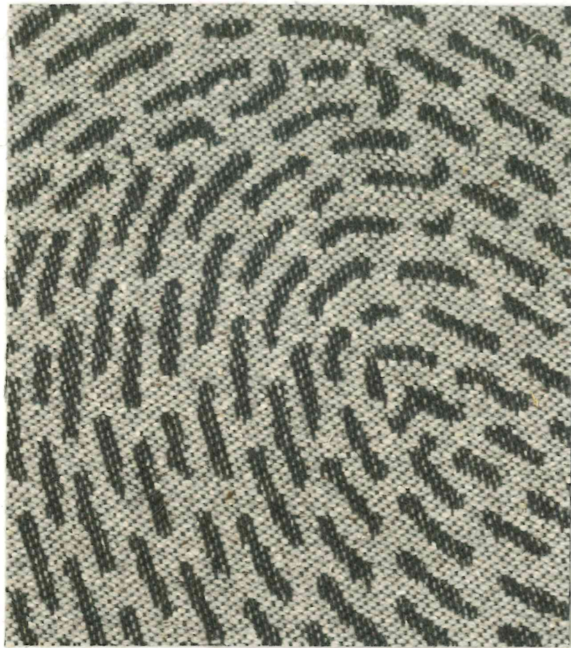
Craigmore Item Code CF1115/0101