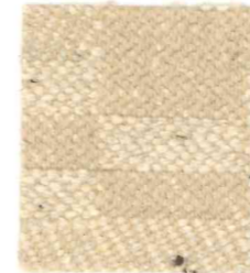
Sinclair Item Code CF1116/0101