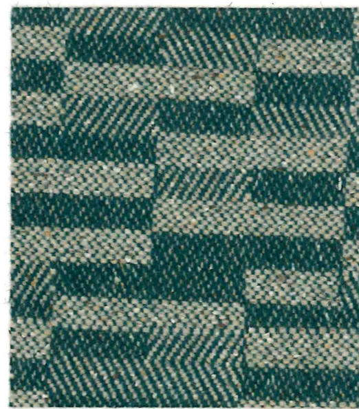
Stewart Item Code CF1116/0503