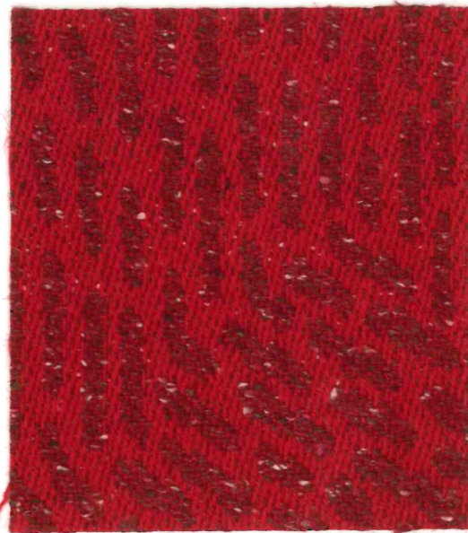
Kerrycroy Item Code CF1115/0503