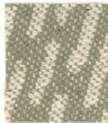
Scalpsay Item Code CF1115/0201