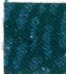
Rothesay Item Code CF1115/0402