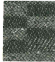
Douglas Item Code CF1116/0705