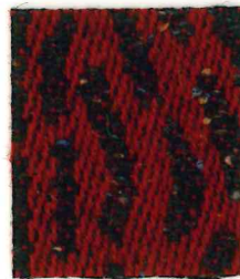
Kingarth Item Code CF1115/0604