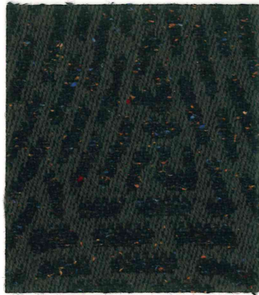
Kilchattan Item Code CF1115/0104