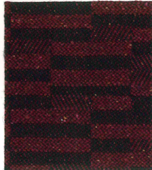
Montgomery Item Code CF1116/0806