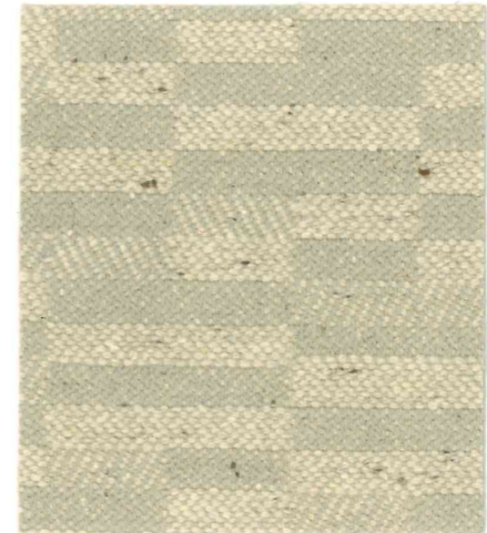
Colquhoun Item Code CF1116/0201