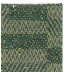
Ross Item Code CF1116/0402