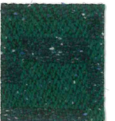
Forbes Item Code CF1116/0604