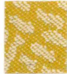
Straad Item Code CF1115/0301