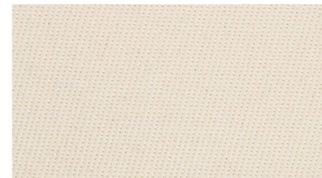
Ecrú Item Code CF1134/0101