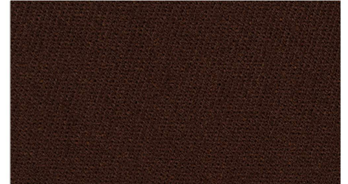
Earth Item Code CF1134/0404