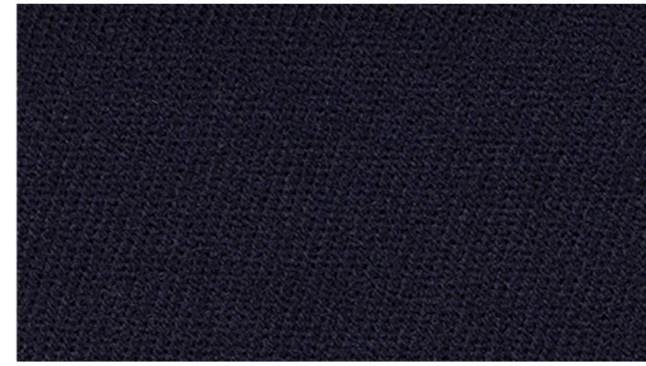
Midnight Item Code CF1134/0303

The quality of the craftsmanship and the appreciation for detail in the design and manufacturing process has resulted in a collection of fabrics that are distinctive, practical and beautiful. This collaboration combines Tom Dixon's sculptural and eccentric design aesthetic with Bute Fabric's specialist skills in the traditional art of weaving, resulting in a versatile collection that captures the spirit of both brands.