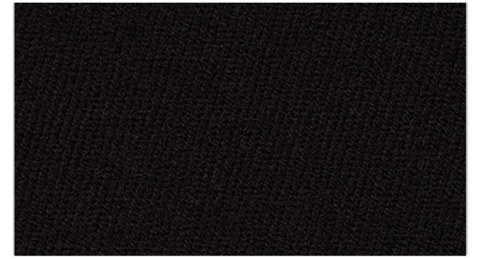
Coal Item Code CF1134/0202