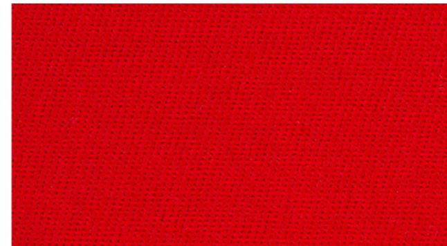
Ilex Item Code CF1134/0606