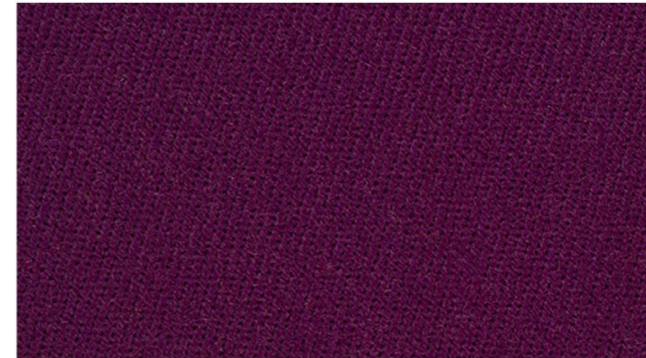
Aubergine Item Code CF1134/0505