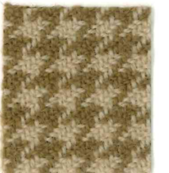
Wheat Item Code CF752/3838