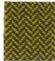
Marsh Item Code CF751/1534