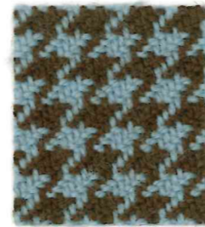
Harris Item Code CF752/2323