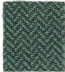
Rain Item Code CF751/1228