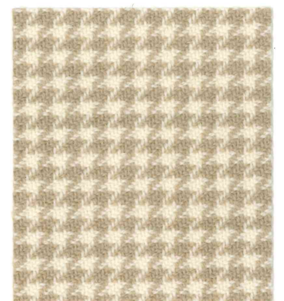
Barn Owl Item Code CF752/0202