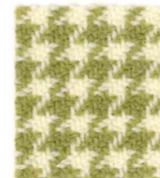
Celery Item Code CF752/1515