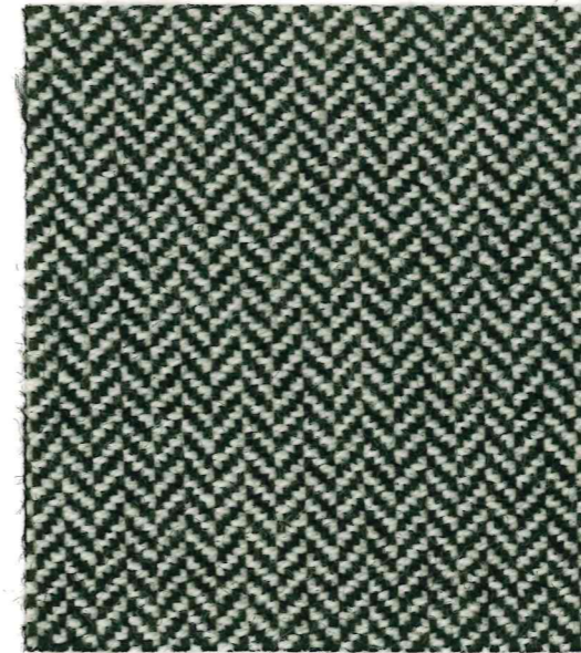
Herring Item Code CF751/0102