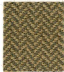
Stag Item Code CF751/1450