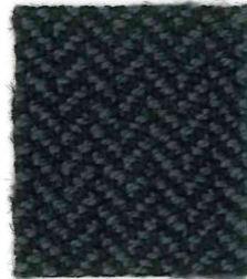
Puddle Item Code CF751/0809