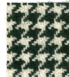
Houndstooth Item Code CF752/0101