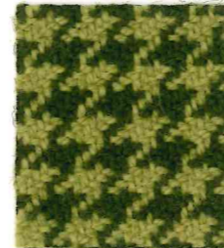
Fir Item Code CF752/2727