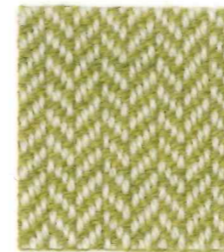
Palm Item Code CF751/1734