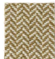
Fawn Item Code CF751/0302